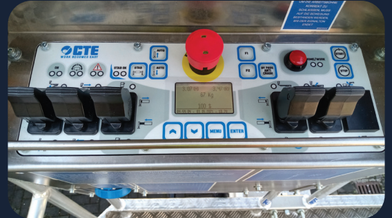
New basket controls