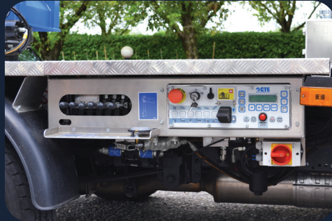
New ground controls