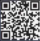
Watch the video